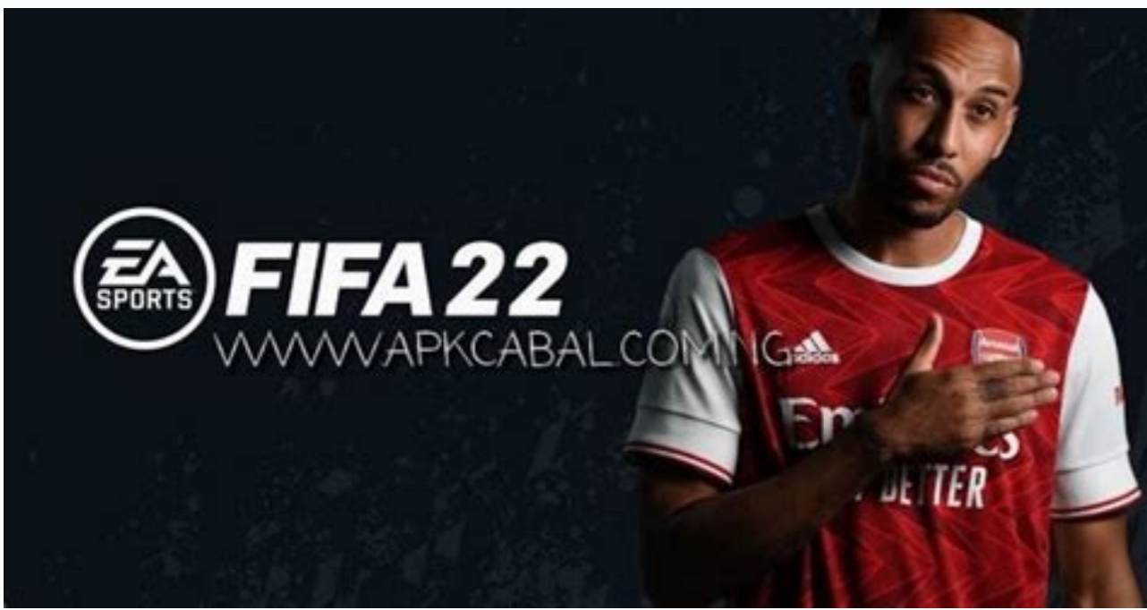
Fifa 2021 psp iso file download. Fifa 19 psp iso file download. Fifa 20 psp iso file download. Fifa 18 psp iso file download. Fifa 22 psp iso file download. Fifa 21 psp iso file download. Fifa 21 psp iso file download ps5. Fifa 23 psp iso file download.